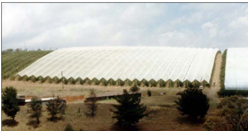
Hail Guard - Pitch netting

The NetPro Group are leaders in the design and construction of Protective Canopy Systems. Our collective experience is immense, providing you with: Custom-designed solutions through one-on-one consultation Extensive and ongoing research & product development Staff field knowledge and expertise Warranties on workmanship and products