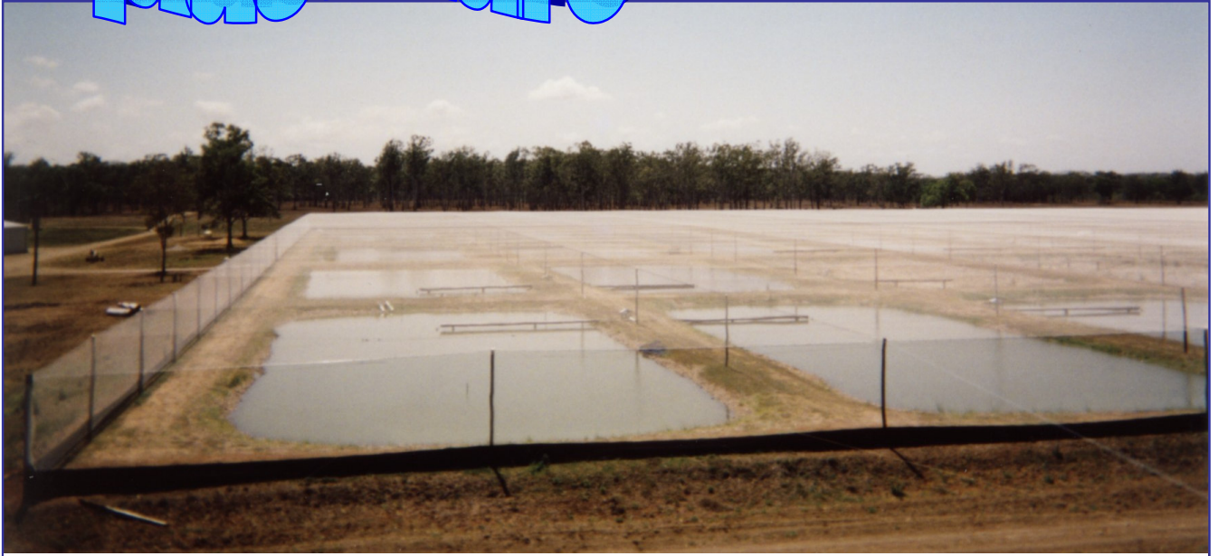
Above: Completed Bird-netting structures over Ponds. Below Left: Detail of Gate and Vermin-Proofing for Aquaculture. Below Right: Heavy Shade Structures over Abalone.