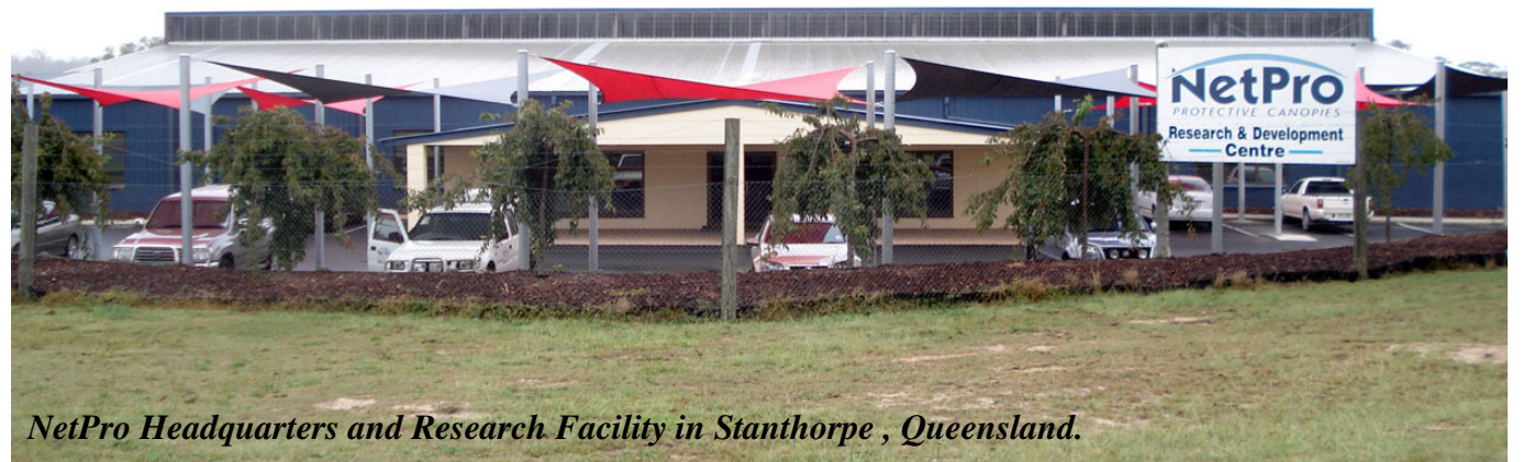
NetPro Headquarters and Research Facility in Stanthorpe , Queensland.

Visit our website for more photos and product specifications.