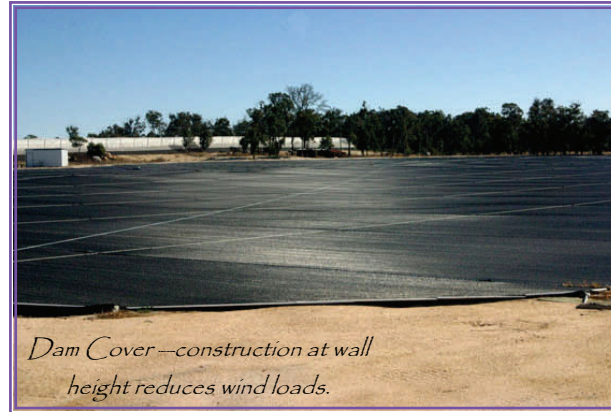
Dam Cover—construction at wall height reduces wind loads.