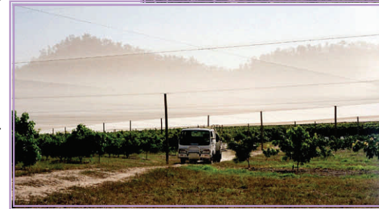
Left: Under the net canopy.