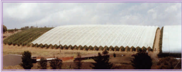
Pitch-style hail protection over an orchard.

NetPro Pty Ltd is an Australian company, specialising in the design and construction of Protective Canopy Systems. The company has been established for well over a decade and has designed many specialized structures to suit customer requirements. These include hail protection, permanent pest protection, wind and sports barriers, water storage covers and various commercial shade structures.