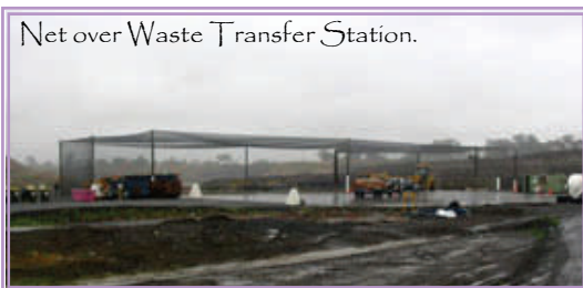
Net over Waste Transfer Station.

A number of attributes set NetPro apart: