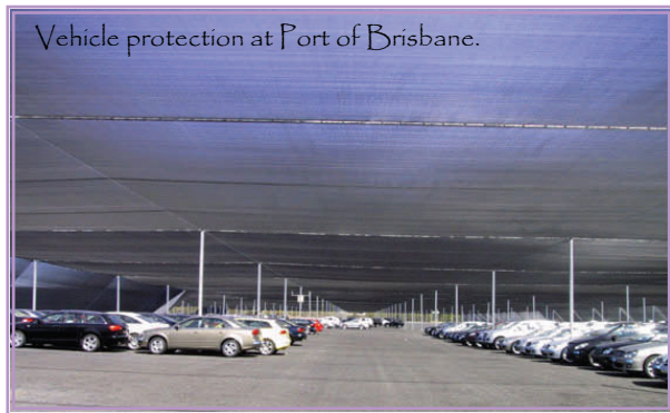
Vehicle protection at Port of Brisbane.

NetPro Pty Ltd is an Australian company, specialising in the design and construction of Protective Canopy Systems. The company has been established for well over a decade and has designed many specialized structures to suit customer requirements. These include hail protection, permanent pest protection, wind and sports barriers, water storage covers and various commercial shade structures.