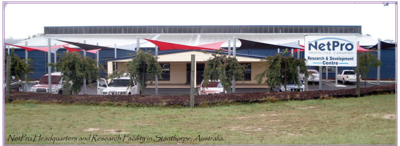
NetPro Headquarters and Research Facility in Stanthorpe, Australia.