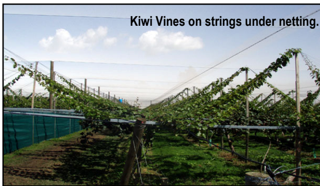
Kiwi Vines on strings under netting.