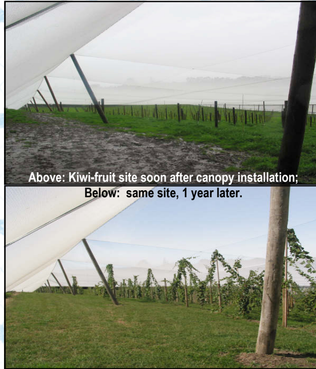
Above: Kiwi-fruit site soon after canopy installation; Below: same site, 1 year later.