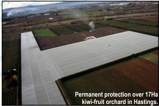
Permanent protection over 17Ha kiwi-fruit orchard in Hastings.

NetPro Pty Ltd specialises in the design and construction of Protective Canopy Systems. Twenty years ago, the founding directors emigrated to Australia from New Zealand and established the company. Netpro works with a number of agents and contractors throughout New Zealand. We have designed many specialized structures to suit customer requirements. These include hail protection, permanent bird or wind protection, and shade structures.