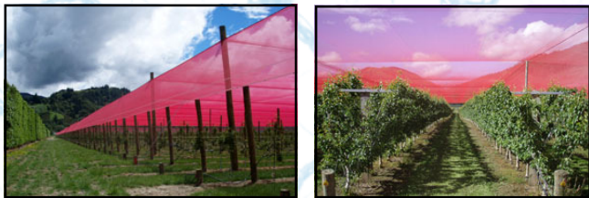
Coloured net over apples and trellised pears.

NetPro's service philosophy proudly delivers: