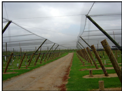
Hail-netting over kiwi-fruit vines.