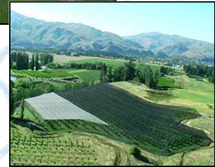
Right: Birdnetting over Cherries.

Horticulture is not the only industry to benefit from protective canopies. NetPro has been involved in the development of technology in a number of growth industries developing various protective structures for aquaculture, intensive livestock feedlots, worm farms, plant nurseries, vehicle yards, schools, kindergartens and domestic use - these include overhead structures windbreaks and dam-covers.