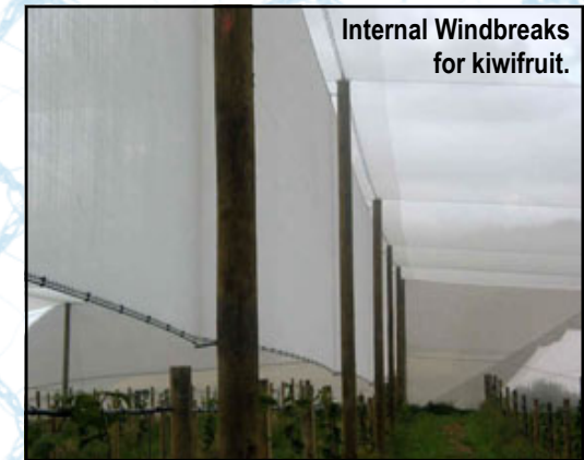
Internal Windbreaks for kiwifruit.

Horticulture is not the only industry to benefit from protective canopies. NetPro has been involved in the development of technology in a number of growth industries developing various protective structures for aquaculture, intensive livestock feedlots, worm farms, plant nurseries, vehicle yards, schools, kindergartens and domestic use - these include overhead structures windbreaks and dam-covers.