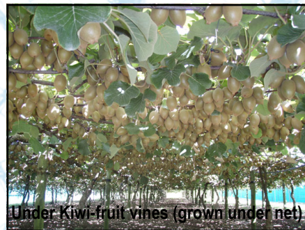
Under Kiwi-fruit vines (grown under net)