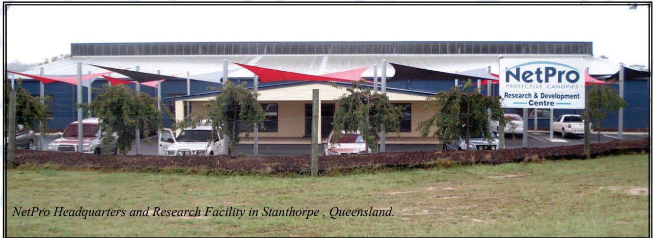
NetPro Headquarters and Research Facility in Stanthorpe, Queensland.