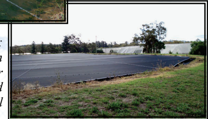
Right: Dam Cover installed at wall height.