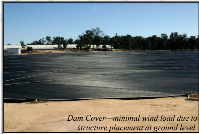
Dam Cover—minimal wind load due to structure placement at ground level.

NetPro Pty Ltd is a Queensland based company, specialising in the design and construction of Protective Canopy Systems. The company has been established for well over a decade and has designed many specialized structures to suit customer requirements. These include hail and bird protection, and shade structures.