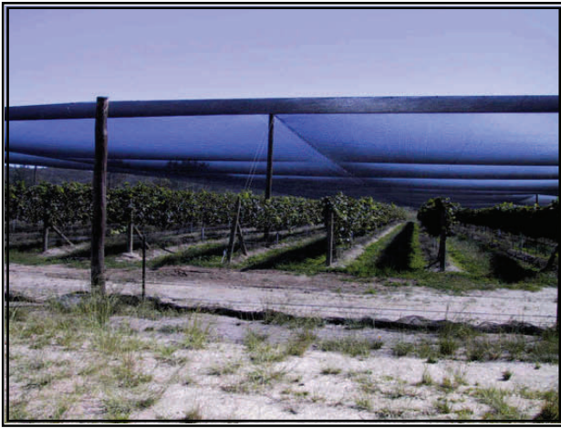
Above: Bird Exclusion Netting over a Vineyard. Below: Under hail-netting.